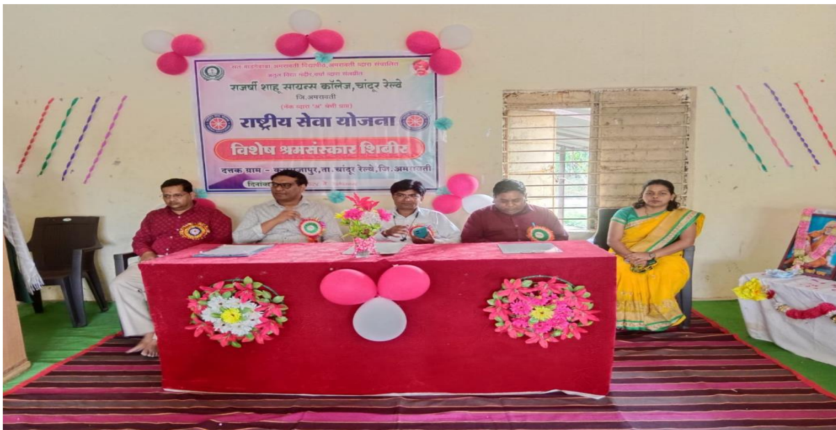
Guest lecture on "Indian Constitution and Our Responsibilities."