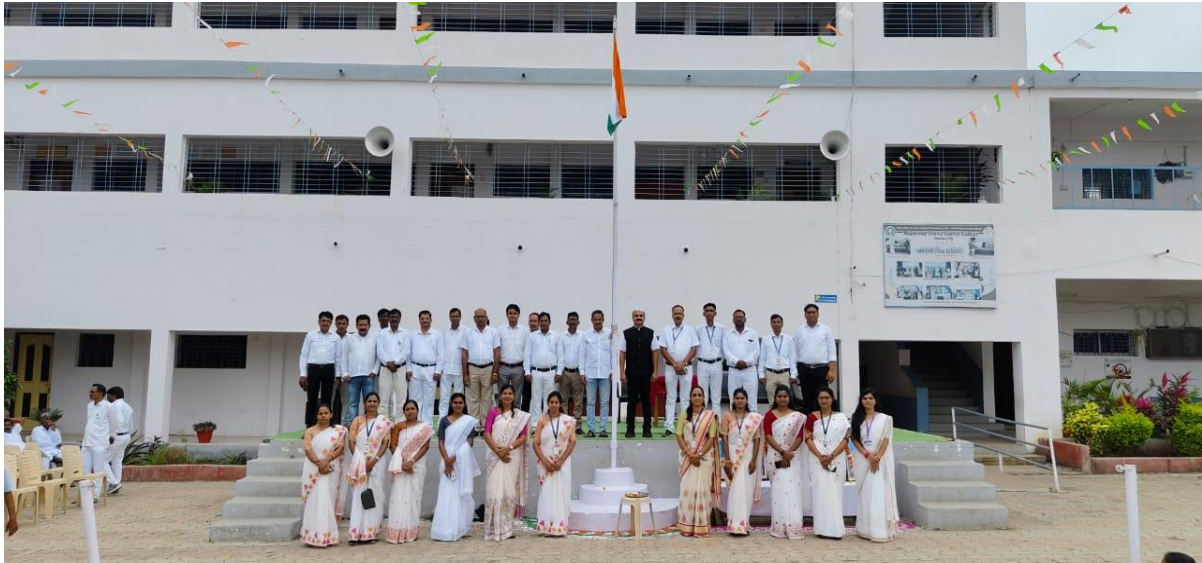
Independence Day Celebration 15 th August