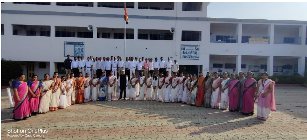
Maharashtra Day Celebration 1 st May