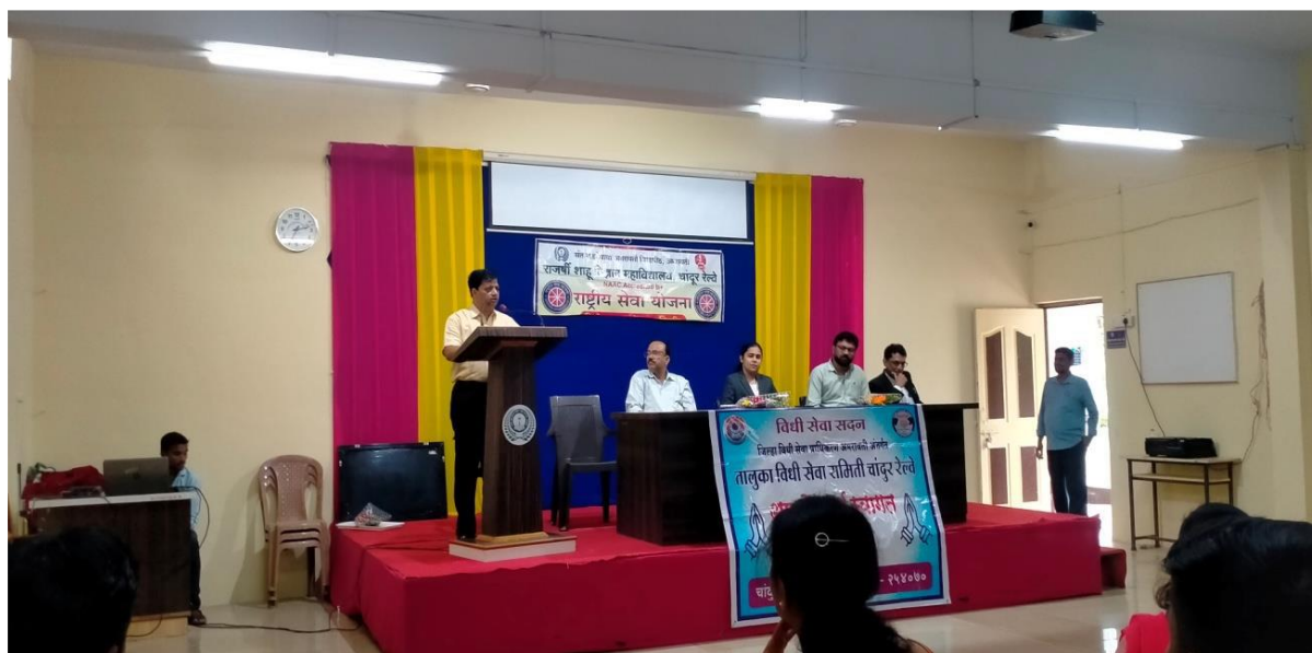
A Legal Awareness program