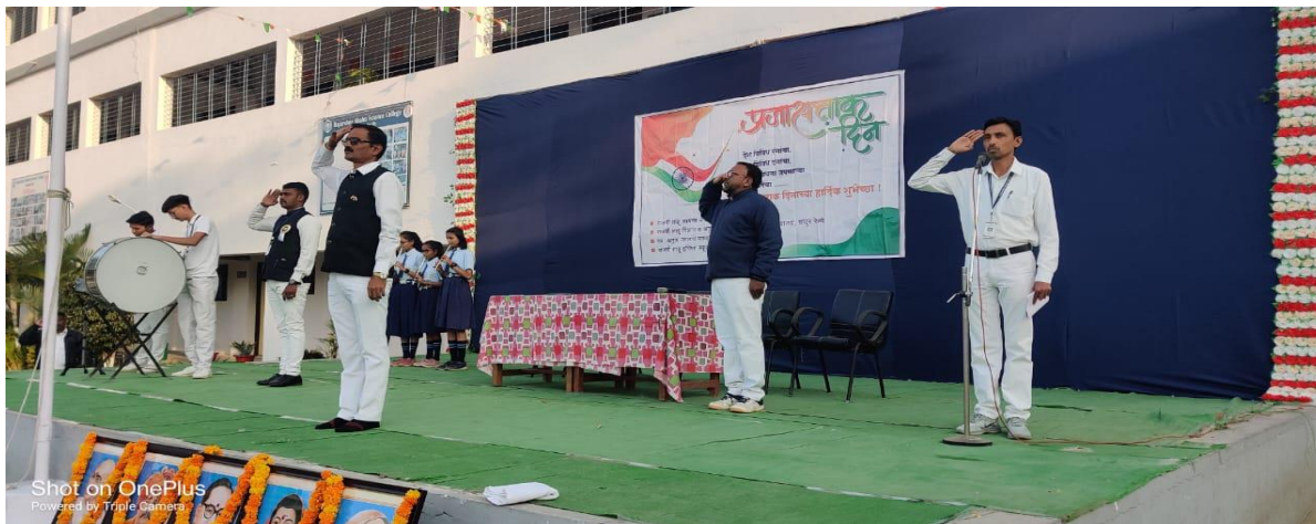
Republic Day Celebration 26 th January