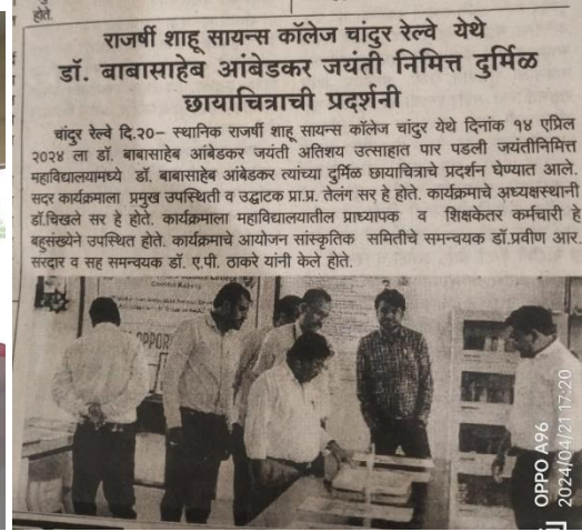
Celebration of Dr. Babasaheb Ambedkar Birth Anniversary