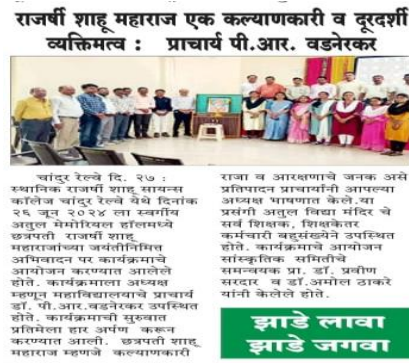
Birth Anniversary of Chatrapati Rajarshee Shahu Maharaj